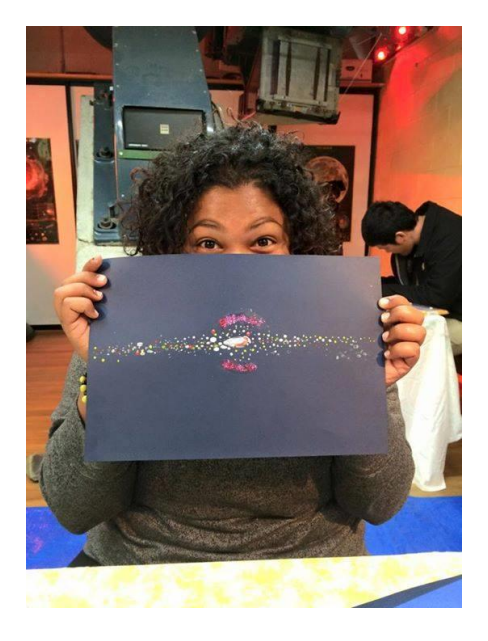
Figure 1 AstroCrafts at Astro Cafe, Lake Tekapo, New Zealand.

Below are some program highlights, followed by a complete list of GAM 2015 programs.