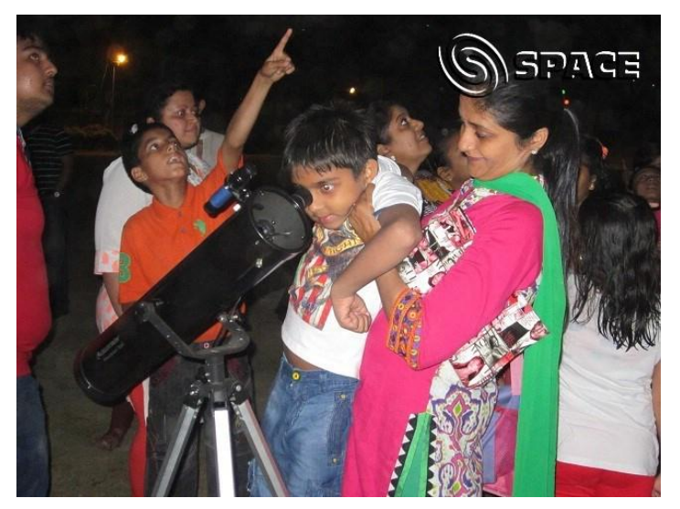
Figure 4 Students and parents from CSE Bal Bharati Public School, Pitampura, India observing the Moon and planets during the Global Star Party.

The Global Star Party is always the highlight of the observing programs in GAM and the 2015 edition, held on Saturday evening, April 25, was no exception. Skywatchers around the globe turned out to discover, share, and celebrate the night sky. Astronomy clubs, observatories, schools and individuals hosted star parties, inviting friends, family, students and the general public along to share in the beauty of our night sky. Some groups organised public lectures and other activities to supplement the observing programs. Groups shared their experiences with us through hundreds of photos and posts on social media and via dozens of member reports on the AWB website.