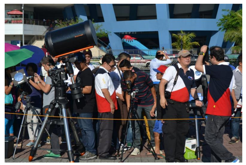
Figure 6 SunDay event with the Astronomical League of the Philippines in cooperation with Exploreum

SunDay is a worldwide observing program with observing events and other educational programs celebrating our closest star, the Sun. Held this year on April 12, SunDay was very popular and produced many member reports and photographs showing people of all ages, all over the world, taking part in celebrating our Sun.