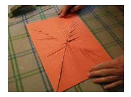
Carefully place all the rest of the orange triangles to match the outside edge of the brown and black sheets.