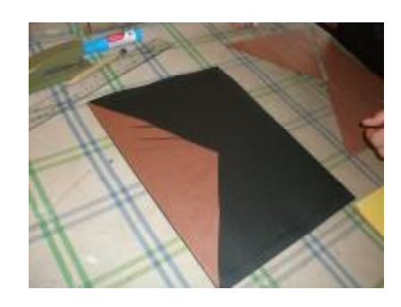
Carefully match the outside edge and place the brown on the black sheet.