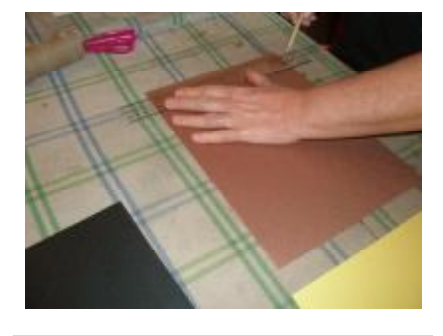
With a ruler draw a 1/2 inch border around the edge.