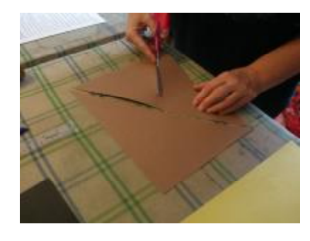
Cut the other direction making 4 triangle pieces. Keep those pieces in order.