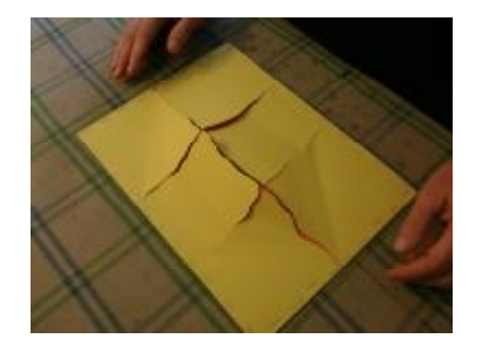
To store, place all the brown, then orange currents under the yellow.