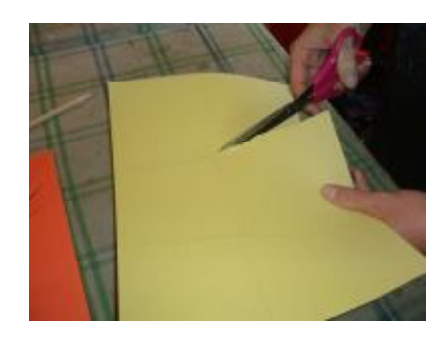
Cut in on one line only on the yellow sheet and cut into the center.