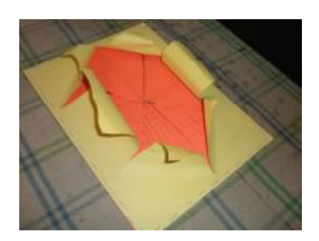
You can make it tighter with your fingers if you wish.