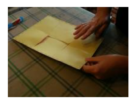
Take the stapler and staple all the way around the edge to secure the sunspot.