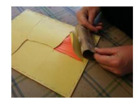
Taking the paper core, form the yellow granules around it to form a nice curve.