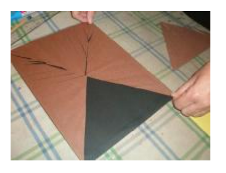
Continue to carefully set all the brown triangles on the black.