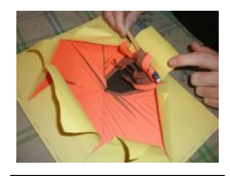
With the pencil, roll the orange and brown currents around the pencil.