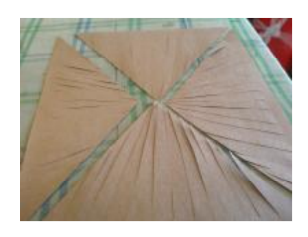
The first layer of convection currents should look like this.