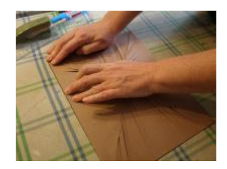
Press down all around the edges so the glue adheres to the sheets.