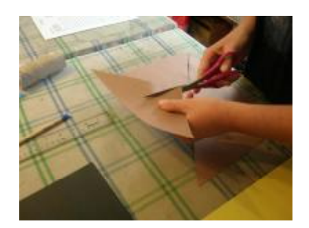
Take one triangle and cut from the center point to the edge but DO NOT CUT THROUGH pencil line.