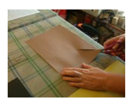
Cut along the first diagonal line from corner to corner.