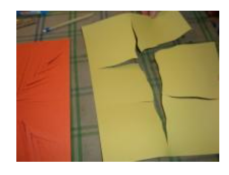
Your yellow surface should look like this with only one cut through on the edge.