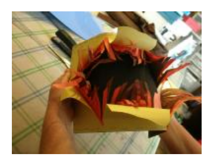
If you bend it, it will open wider and be more dramatic.