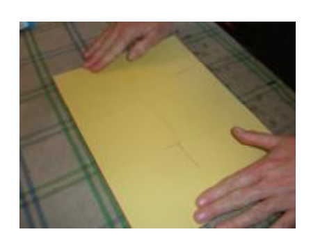
Smooth along the outer glued edges making sure the edges are lined up to the orange sheet.