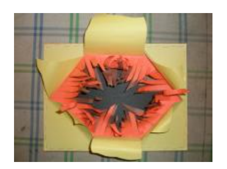
Work with the currents to bend over the yellow and you shall see the black umbra underneath.