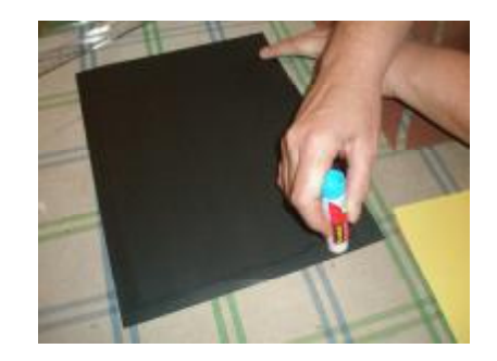
Take the black sheet and run a small bead of glue around the edge