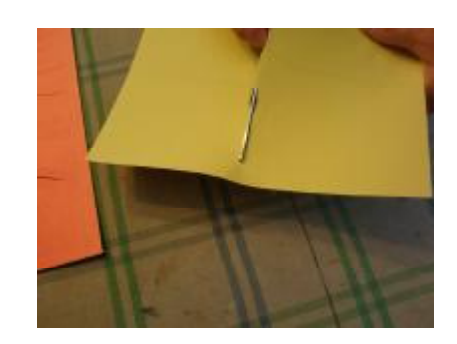
Leave some space at the edge.