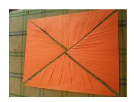
The completed orange layer.