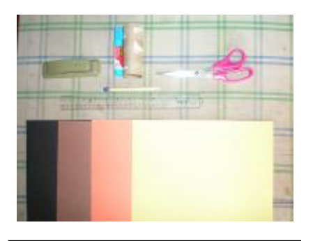
Take the black construction paper and leave that alone – it will be the umbra.

Scissors Elmer's glue or glue sticks Core rolls from toilet paper Stapler and staples