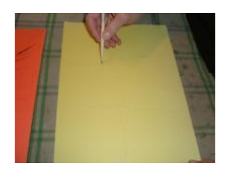
Draw granules on the yellow sheet.