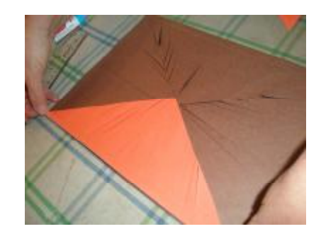
Carefully match the outside edges to the brown and black sheets.