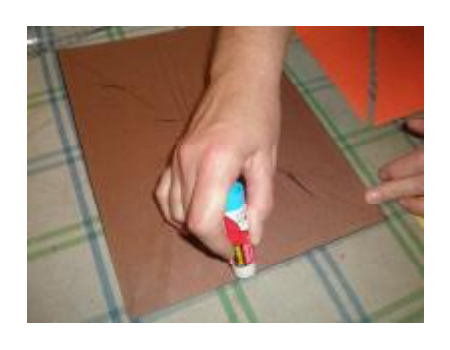
Run a line of glue around the edge of the brow and black sheets.