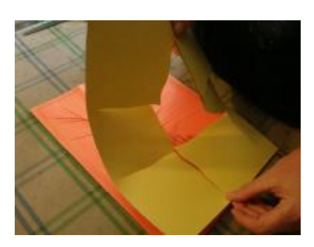
Run a bead of glue around the edge of the orange paper and lay down the yellow sheet on top.