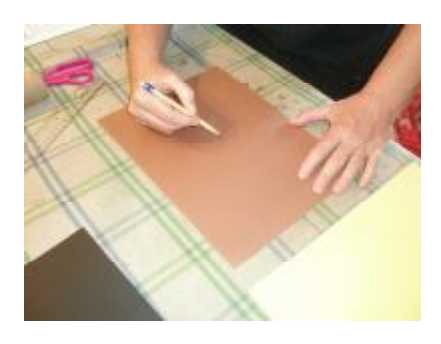
Take a pencil and draw an "X" from corner to corner on the brown paper.