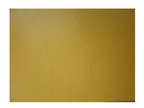
Make 6 granules on this page. See page 3 for better detail.